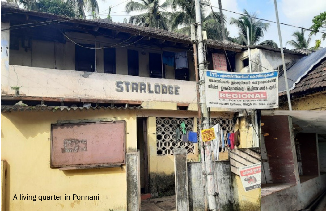
A living quarter in Ponnani