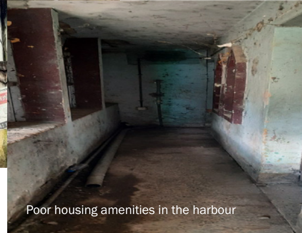
Poor housing amenities in the harbour