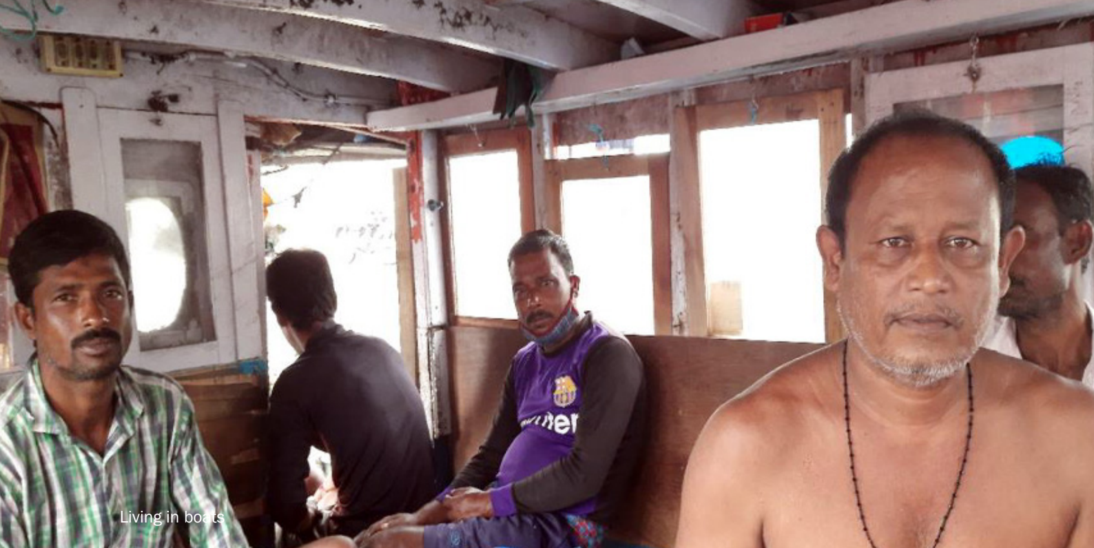
Living in boats