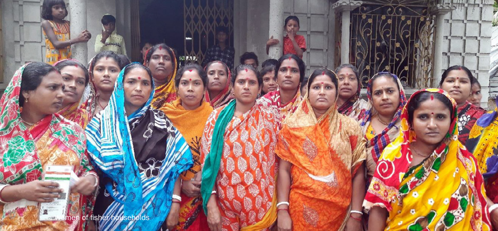
Women of fisher households

The delta is a rich assemblage of mud flats, islands, water bodies and arable land mass, interconnected by creeks, channels and tidal creeks. Subsistence agriculture, fishing, woodcutting, honey extraction, and crab collection form the sources of livelihood for the inhabitants who subsist on areas around the protected ecological habitat of the Sundarbans. The climate is tropical in nature with long spells of dry (November to April) and wet seasons (May to October). The region witnesses massive rainfall for four months between June and September and is affected by tropical cyclones, floods, tidal erosion and wind damage that severely disrupt the lives and livelihoods of communities.