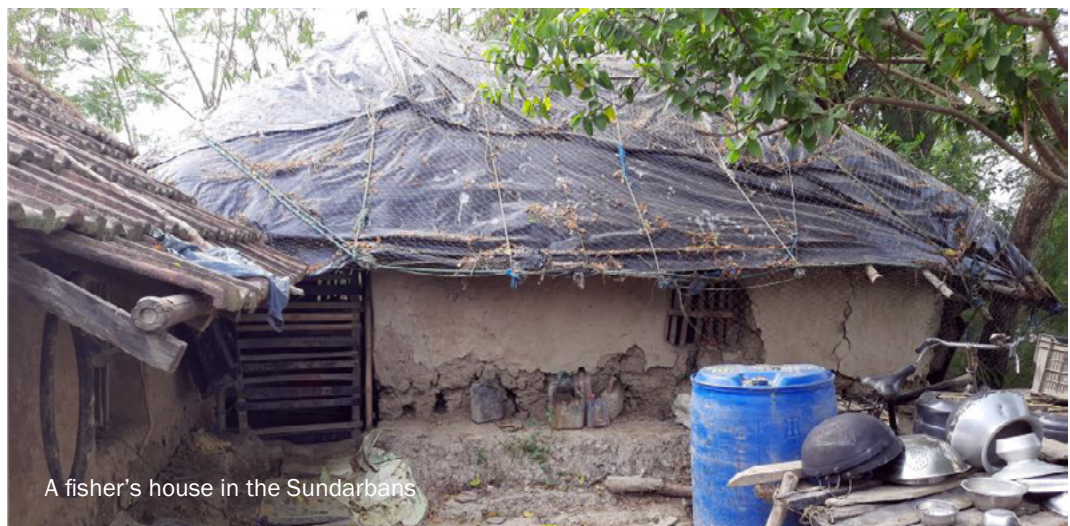
A fisher's house in the Sundarbans

The deltaic ecosystem of the Sundarbans is a part of the lower deltaic plain of the Ganges-Brahmaputra-Meghna river basin in the Bay of Bengal and extends over India and Bangladesh. It is home to the largest mangrove forest in the world and is a biodiversity hotspot.