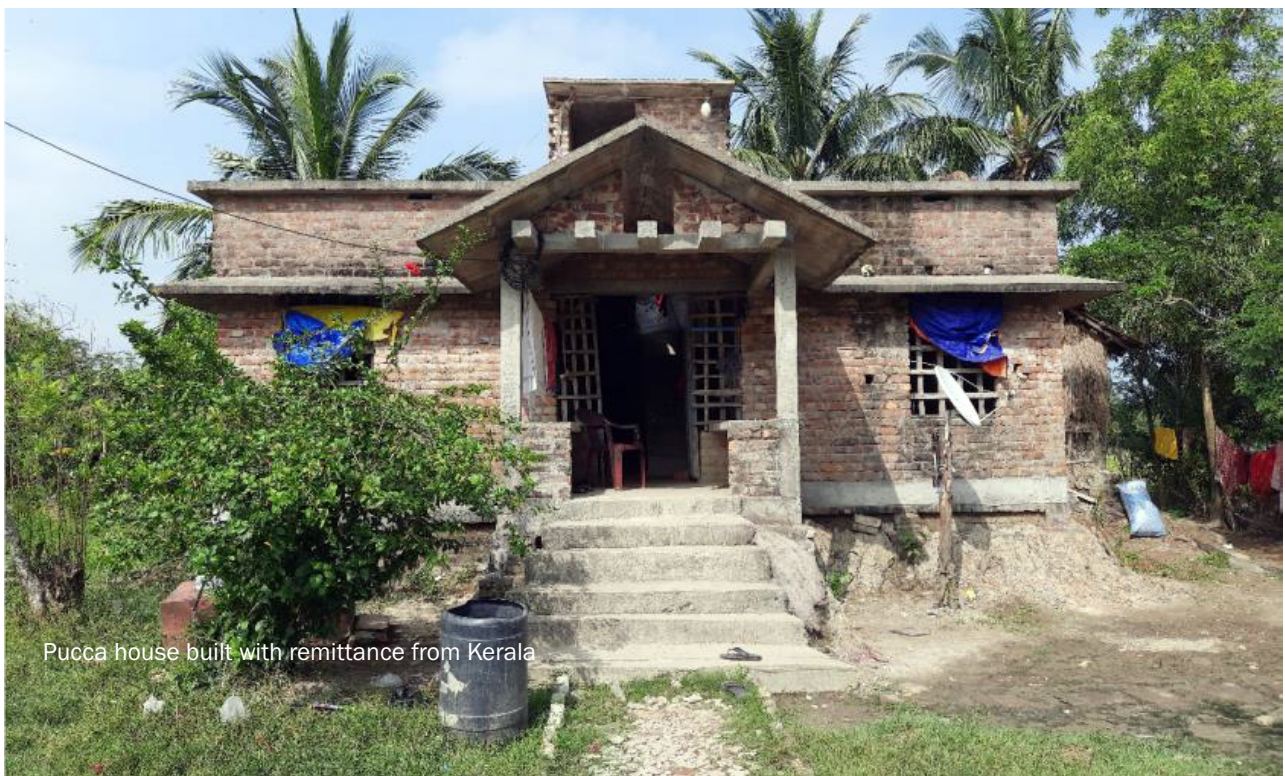
Pucca house built with remittance from Kerala

Migration of traditional fishermen from the Indian Sundarbans in the state of West Bengal to the marine fishing harbours of north Kerala has a relatively shorter history starting around the 2000s. Large scale destruction of mangroves, repeated onslaught of cyclonic storms, recurrence of extreme climate events, rapid coast line erosion and rising sea level caused by climate change have kept the eco-region of Sundarbans in a state of constant flux. Further, livelihood opportunities are limited to paddy cultivation, fishing and a few forest based activities. These are seasonal occupations with low, irregular and unpredictable income streams. Hence, migration is the only viable livelihood strategy for a majority of households. However, as the paper demonstrates, migration has not reduced the vulnerability of workers as they face informal work arrangements, non-standard forms of wage payment, lack of proper amenities like housing and sanitation, and a near absence of state initiatives to protect their rights and entitlements.